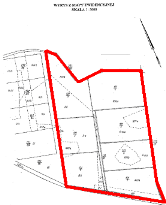
WYRYS Z MAPY EWIDENCYJNEJ SKALA 1:5000

COLLIERS INTERNATIONAL Pl. Piłsudskiego 3, 4th floor 00-078 Warsaw Tel.: +48 22 331 70 00 Fax : +48 22 331 78 01 www.colliers.com